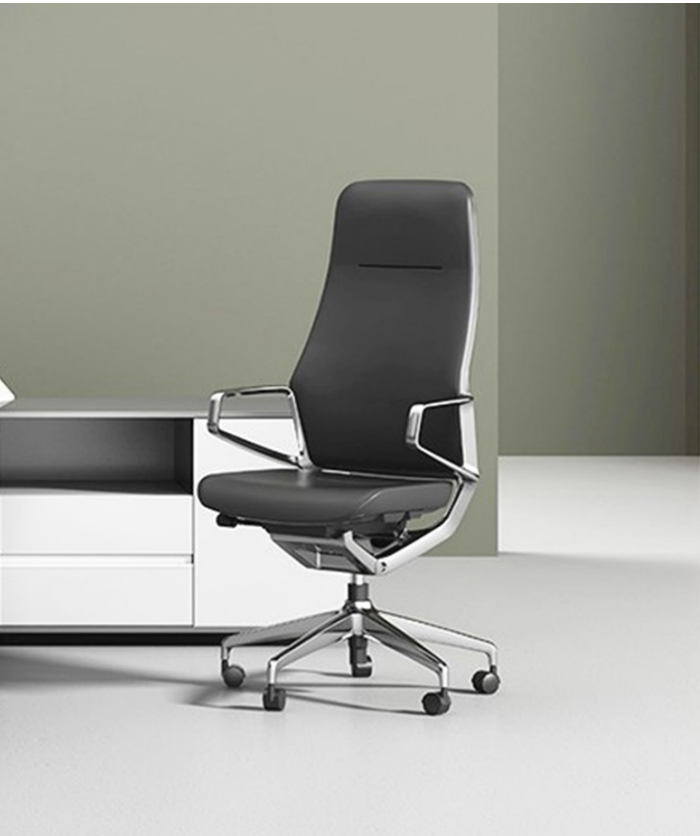
Arico Black with Polished Aluminium Frame