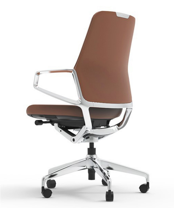
Arico Dark Brown with Polish Aluminium Frame