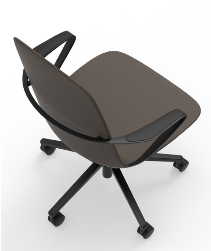
Jetson Coffee with Black Frame