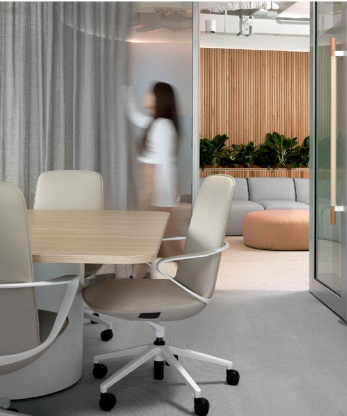
Jetson Grey with White Frame