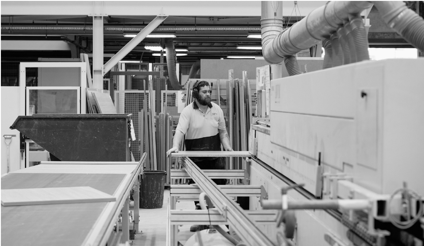
3 | AWM AMAROO

The Jetson chair offers a futuristic blend of functionality and style, making it a standout piece in any boardroom or meeting space. Its innovative design features discreetly integrated height adjustment and tilt levers, maintaining a sleek appearance. With luxurious full-grain leather upholstery available in various sophisticated colours, the Jetson embodies elegance and innovation for a truly refined seating experience.