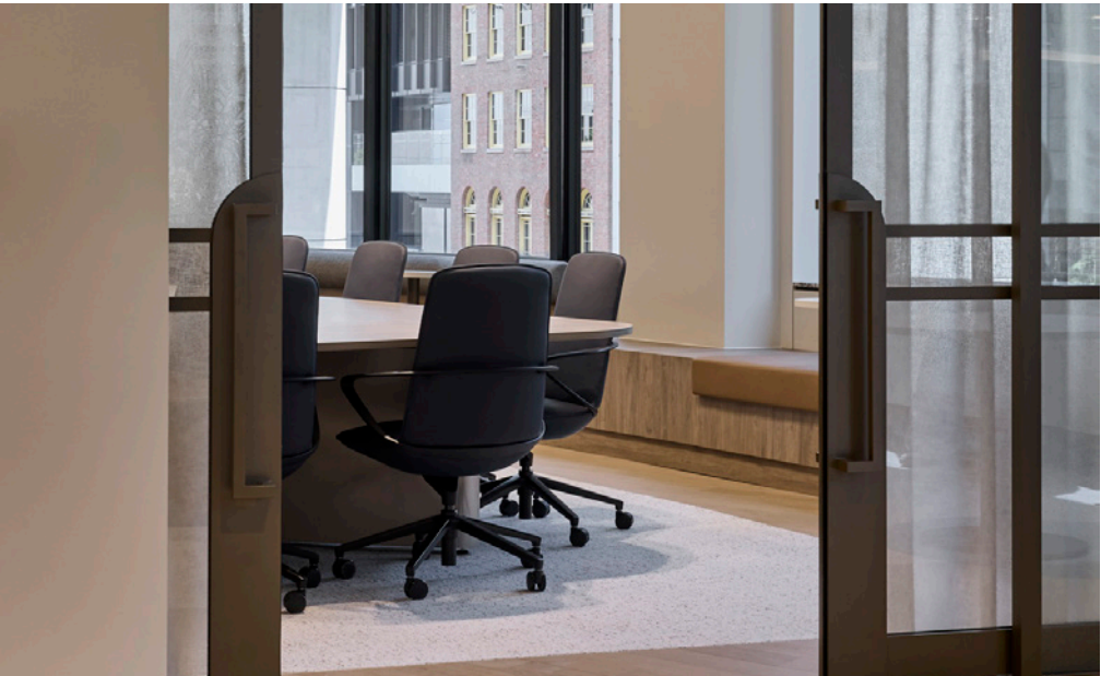
Jetson Graphite with Black Frame

The neat and compact Jetson Meeting Chair features height adjustment and tilt levers that are cleverly built into the seat shell, removing the look of cumbersome levers. The curve of the arms and body shape work in synergy with each other to create a smooth stylish look.