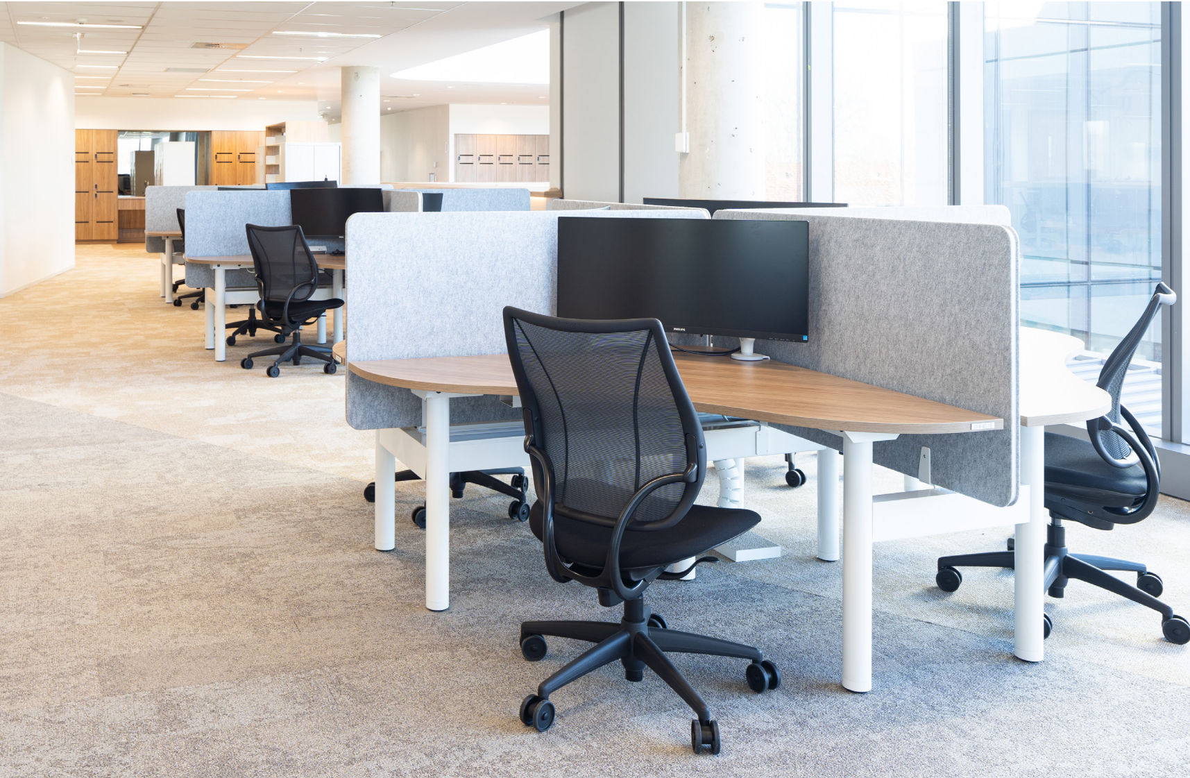
Orange, NSW Liberty Task Chair