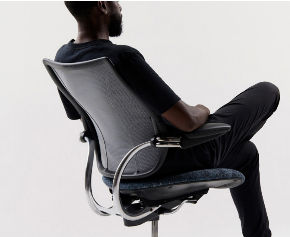
5 | AWM AMAROO

Humanscale's Liberty Task chair is an intelligent mesh task chair engineered to provide automatic lumbar support for every user, as well as offering simplicity and complete ease of use.